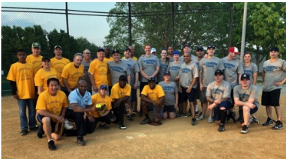
Photo from Gold Shield game in May