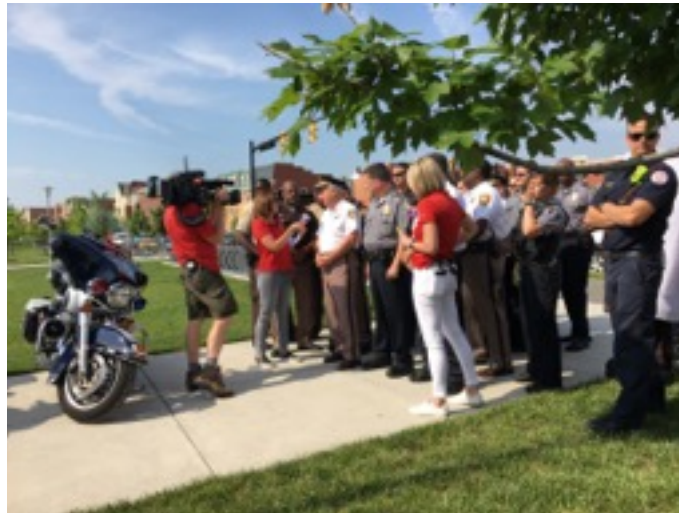
Channel 5 visited Potomac Yard for an early summer Zip Trip

Finally, ASO and APD battled each other in the Gold Shield game in May. APD won but it was close and everyone enjoyed the cookout.